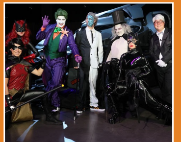
Heroes and Villains pose together at the Connecticut Science Center Gala: Gotham City