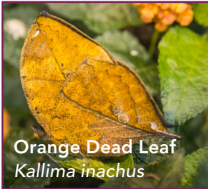
Orange Dead Leaf Kallima inachus

Color – Rich colors come from scales that protect the wings. Each scale is a single color. Often, the scales on the top of a butterfly's wings are brightly colored, while the scales on the underside are patterned for camouflage while the butterfly rests. Butterflies will often rest with wings closed to remain inconspicuous to predators (Think dead leaf). https://www.wired.com/2010/06/butterfly-colors/