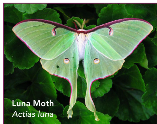
Luna Moth Actias luna