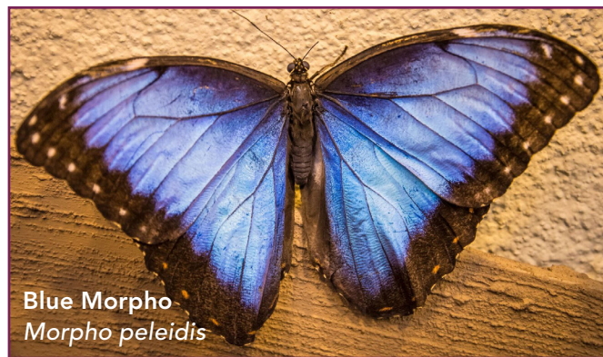
Blue Morpho Morpho peleidis

Most of Wild Wings you saw in the Butterfly Encounter get their color from pigment. The Blue Morpho, however, gets its color from how light interacts with the unique structure of the wing scales. Refracted light gives the Morpho its iridescent blue color. While pigment will get duller over time, the structural color of the Blue Morpho will not fade! Your students may be interested in further researching the topic of light, color and the Blue Morpho's scale structure.