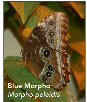
Blue Morpho Morpho peleidis