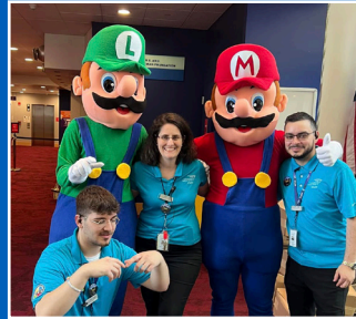
Visitor Experience Team Welcomes Famous Plumbers