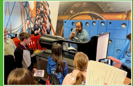
Sikorsky – a Lockheed Martin Company exhibits at the March 31 STEM Career Showcase